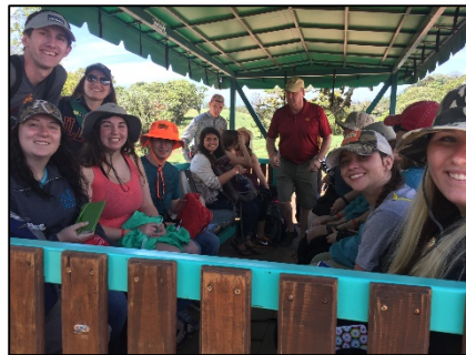
Iowa State University students on their Costa Rica tour in March.