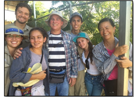
University of Costa Rica (UCR) student who hosted the group during the visit. The UCR students had toured Iowa agriculture in July 2016.